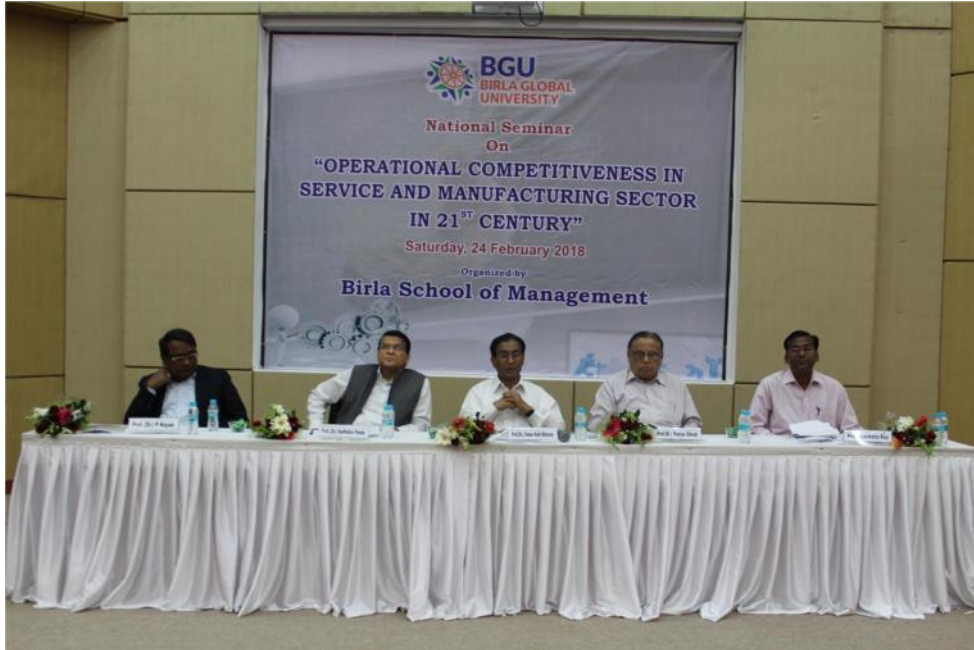
Pic-1: Guests on the dais at the inaugural session