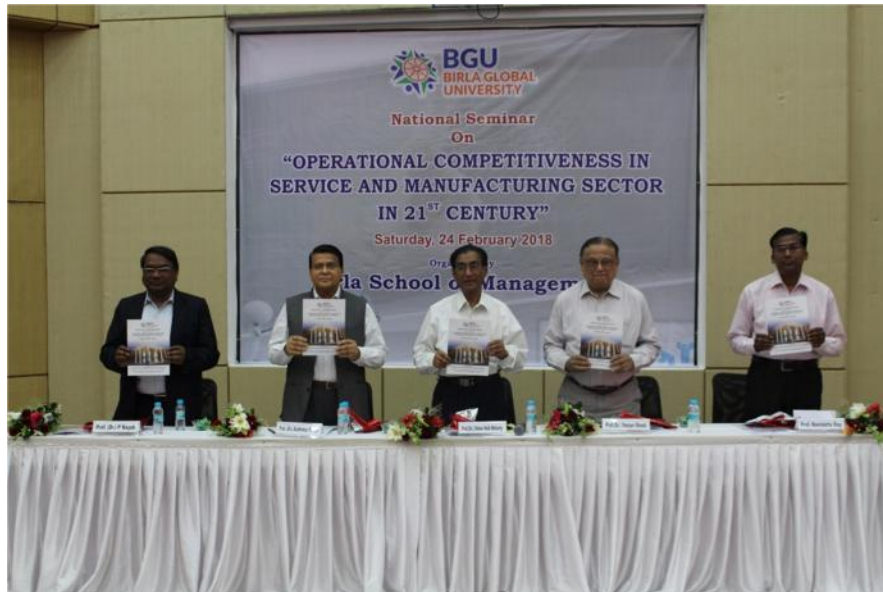
Pic-5: Release of book of Abstracts of Seminar papers by the Dignitaries