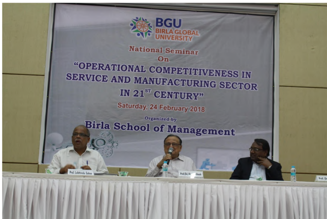
Pic-16: Dignitaries on the Dais in the valedictory session