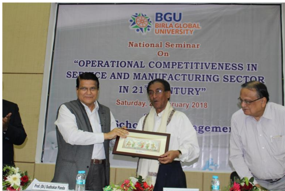
Pic-8: Felicitation of Chief Guest by Hon'ble Vice Chancellor, BGU