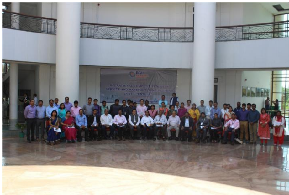
Pic-19: Group Photograph of Guests and participants of the seminar

Pic- 18(a),18(b),18(c),18(d) :Certificate distribution to the paper presenters