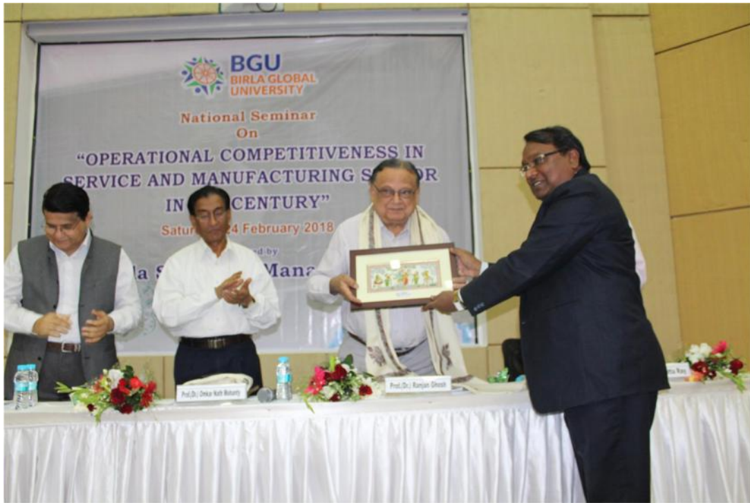
Pic-9: Felicitation of Guest of Honor by Dean, BSoM, BGU